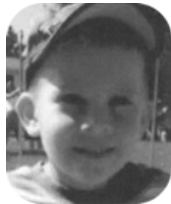
Jack Shors Preschool - 2007-2008