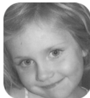
Julia Frank Preschool - 2007-2008