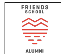
Cody Townsend Senior Class of 2022