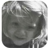
Fiona Hawley Preschool - 2007-2008