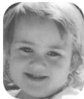
Helen Sebring-Lawler Preschool - 2007-2008