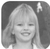
Eleanor Malcom Kindergarten - 2009-2010