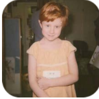
Elizabeth Harding Kindergarten - 2009-2010