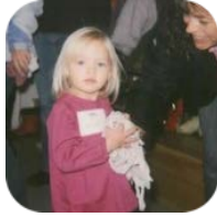
Lila Travis Preschool - 2007-2008