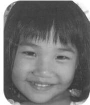
Anna Hullet Preschool - 2007-2008